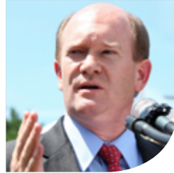
SEN. CHRIS COONS (D-Del.)