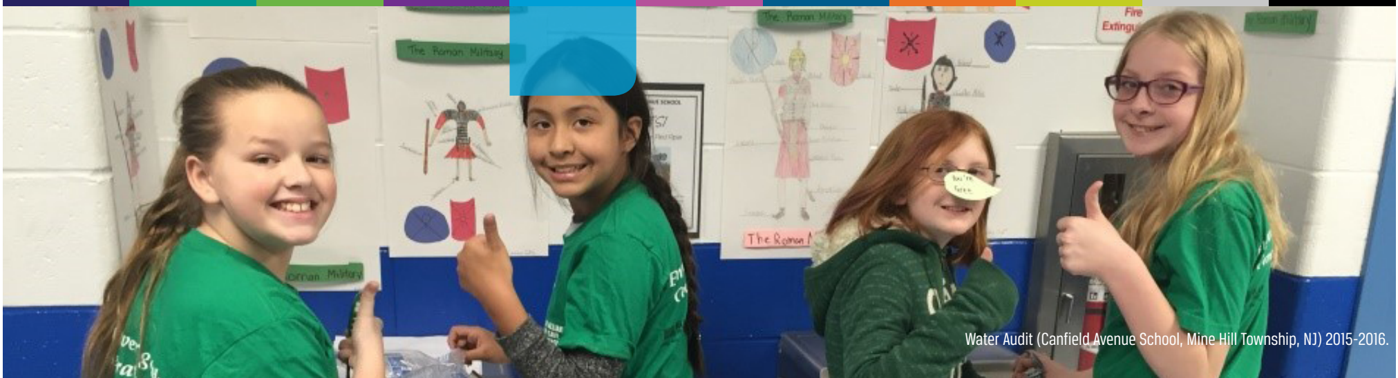
Water Audit (Canfield Avenue School, Mine Hill Township, NJ) 2015-2016.