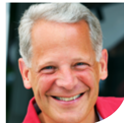
REP. STEVE ISRAEL (D-N.Y.)