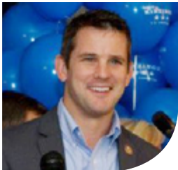
REP. ADAM KINZINGER (R-Ill.)