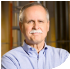
REP. DAVID MCKINLEY (R-W.V.)