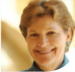
SEN. JEANNE SHAHEEN (D-N.H.)