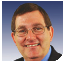
REP. MICHAEL BURGESS (R-Texas)