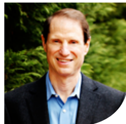
SEN. RON WYDEN (D-Ore.)