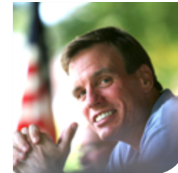
SEN. MARK WARNER (D - Va.)