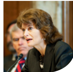
SEN. LISA MURKOWSKI (D-Alaska)