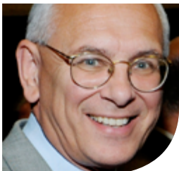
REP. PAUL TONKO (D-N.Y.)