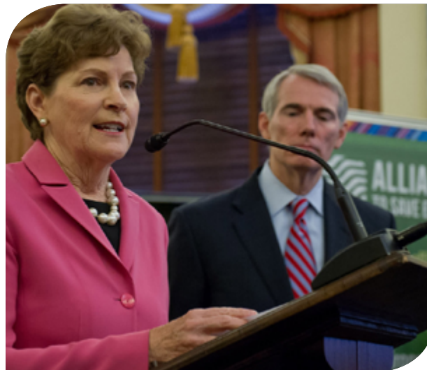
Alliance Honorary Board Members Sens. Jeanne Shaheen (D-N.H.) and Rob Portman (R-Ohio)