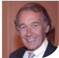
SEN. EDWARD MARKEY (D-Mass.)