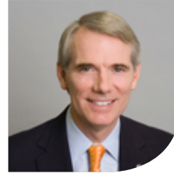
SEN. ROB PORTMAN (R-Ohio)