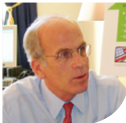
REP. PETER WELCH (D-Vt.)