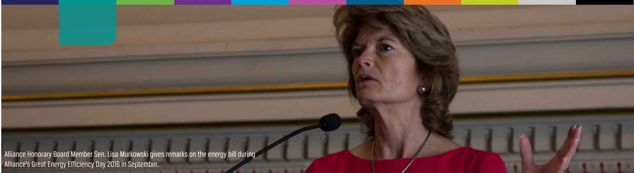
Alliance Honorary Board Member Sen. Lisa Murkowski gives remarks on the energy bill during Alliance's Great Energy Efficiency Day 2016 in September.

Of course, change was in the air after Donald J. Trump won the November presidential election. We are optimistic that efficiency will remain a bipartisan policy solution, and in addition to pursuing legislation left undone in 2016, we will continue working creatively to advance efficiency in areas such as tax reform, infrastructure development, small business productivity and systems efficiency.