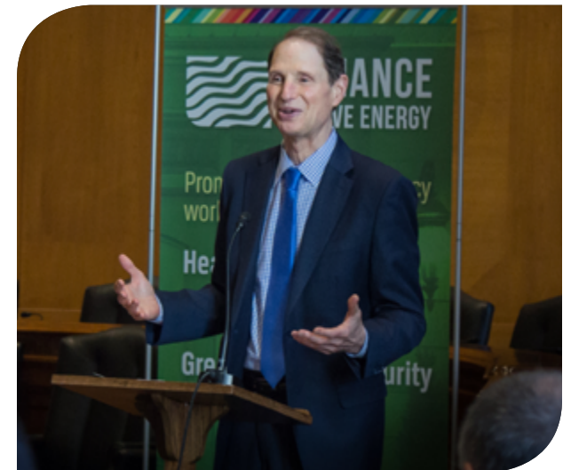
Alliance Honorary Board Member Sen. Ron Wyden (D-Ore.)